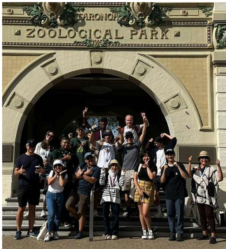
Image 1: The IGPSG Welcome Party/ The students at the entrance of Taronga Zoo to start their workshop.

It was a highly successful event with 20+ international students attending. Taronga Zoo offered a very entertaining and educational workshop to introduce Australian animals to the audience. We were treated to a live bird show, which was very impressive, the preferential reserved seats provided the very much needed shade on a hot day. The immersive workshop gave the students the opportunity to touch and interact with the animals. The Zoo also allowed access to some of the enclosures which are not open to the public. The photo session with the Luigi, the koala, with individual students gave them a souvenir to remember the day by. We were also treated to a sausage bbq and paddlepops afterwards. The feedback from the students were very positive. All in all, one of the best events IGPSG has had so far! Thank you to the efforts of Sophia Maranan and Suzanne Thomas of the Taronga Zoo Foundation and the staff of the Taronga Zoo Conservation Society who took care of us and went out of their way to enable the students to learn as much as they can from the visit.